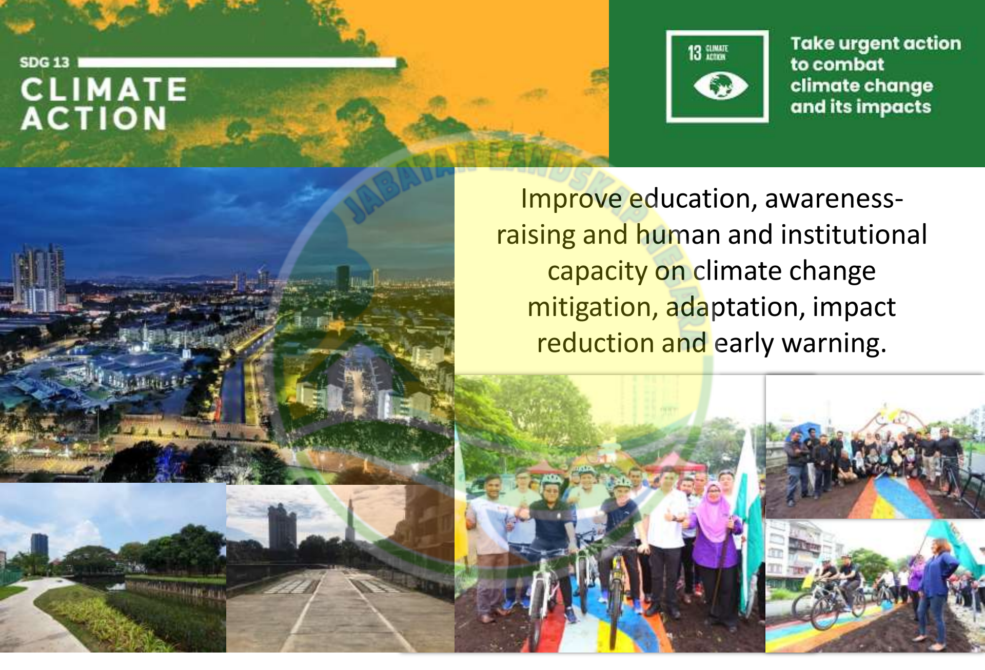
Green Corridor & People's Aquarium 9<sup>th</sup> august 2020